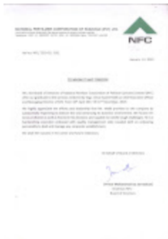
NFC -BoD certificate.jpg 293K