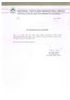
NFML-BoD certificate.jpg 266K