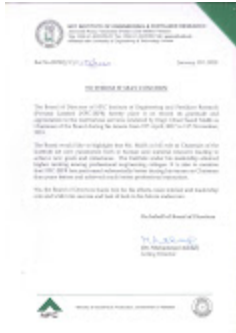
IEFR-BoD certificate.jpg 412K