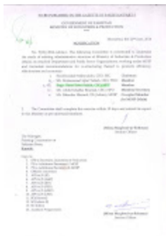
MoIP Notification.jpg 392K